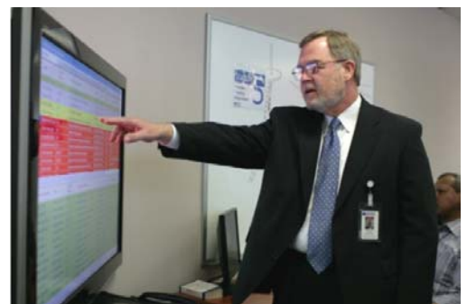
Figure 1: BHL Express Pending Referral Tracking System

Sub-acute Detoxification: Those in withdrawal from drugs and alcohol may be served at CSPs, but there are also two high-capacity specialized programs in Atlanta and Decatur.